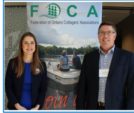
Effective Government Relations