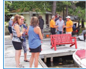
Bridging Gaps in Rural Communities