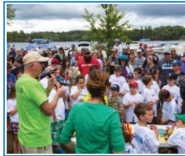
Supporting Volunteer Lake Associations