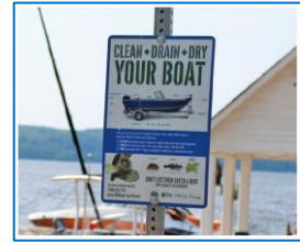
Advancing Science into Action!